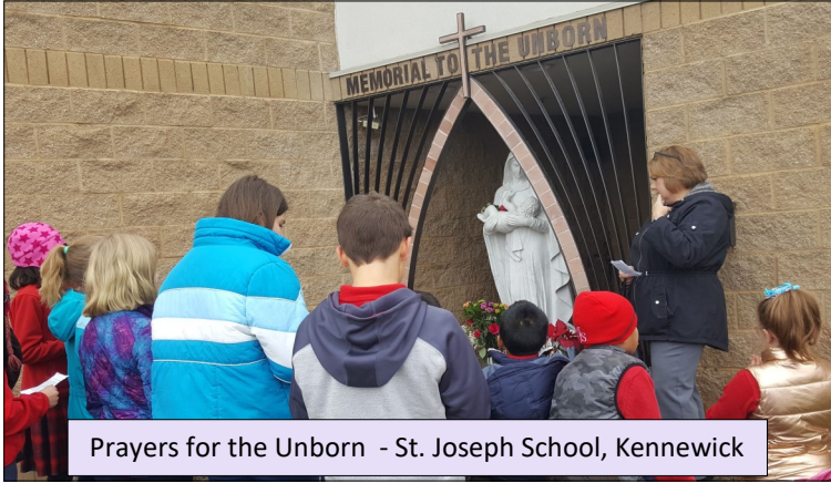
Prayers for the Unborn - St. Joseph School, Kennewick

The St. Joseph School in Wenatchee Honor Choir shared their talents by singing the National Anthem at both a Mariners game and at local hockey events, in addition to providing entertainment at local retirement homes. School-wide the students have participated in Eucharistic Adoration and the Empty Bowls program to help support the St. Joseph Food Bank.