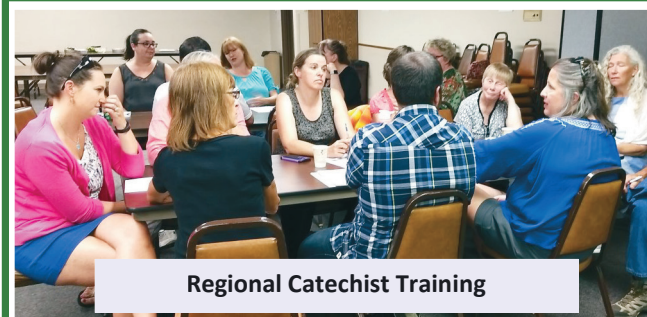
Regional Catechist Training