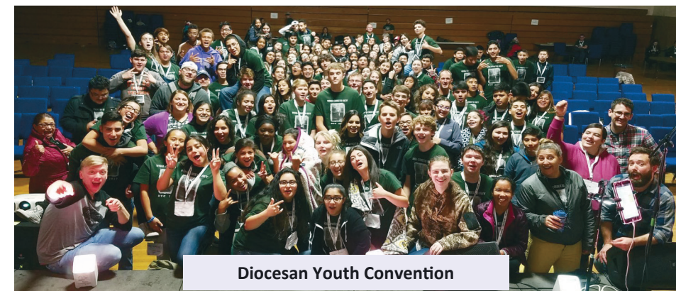
Diocesan Youth Convention

If you cannot join us on October 13, please consider making a gift that will ensure that all of our kids have the opportunity to learn about Jesus Christ.