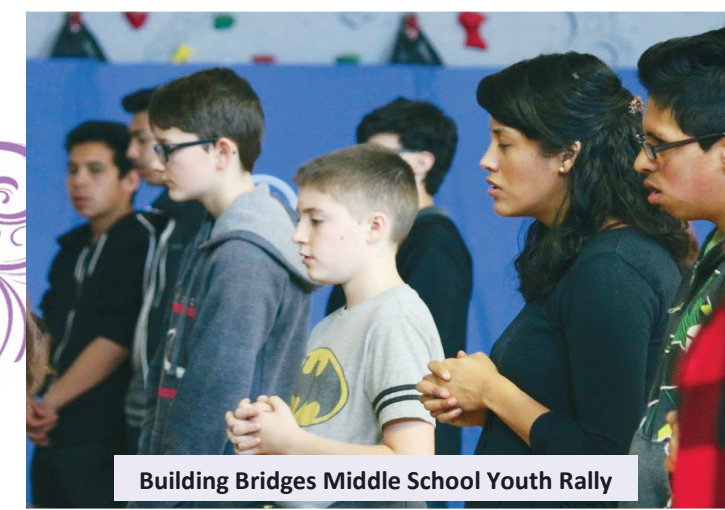
Building Bridges Middle School Youth Rally