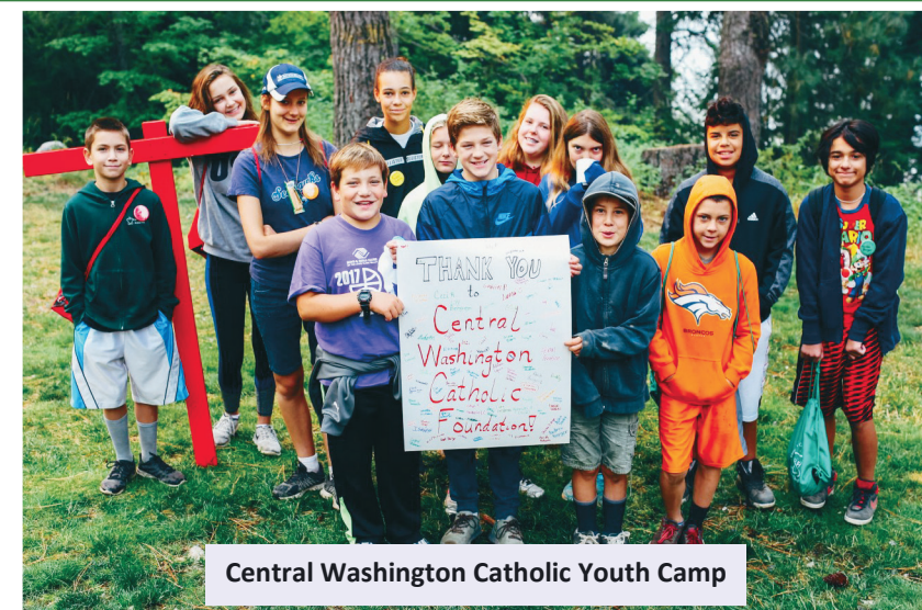
Central Washington Catholic Youth Camp

CHANGING LIVES THROUGH YOUR GENEROUS SUPPORT OF CATHOLIC EDUCATION!