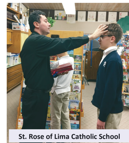
St. Rose of Lima Catholic School