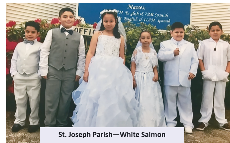
St. Joseph Parish—White Salmon