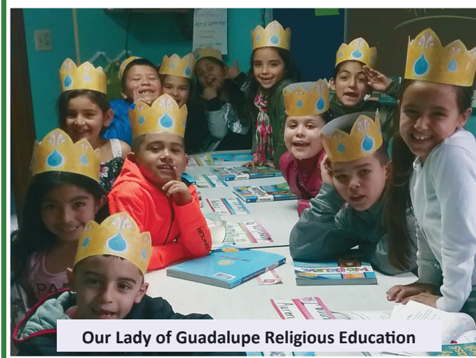
Our Lady of Guadalupe Religious Education