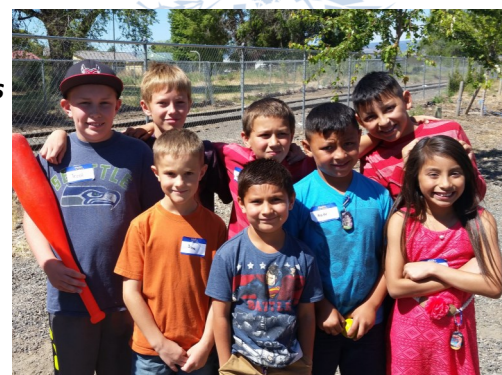
Vacation Bible School St. Mary Parish, White Swan